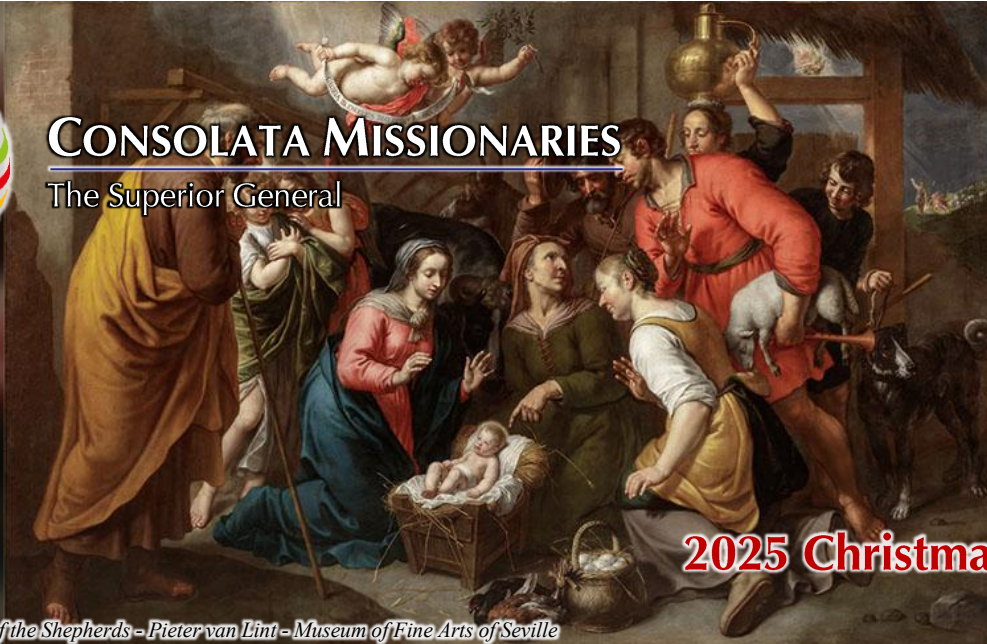
Adoration of the Shepherds - Pieter van Lint - Museum of Fine Arts of Seville